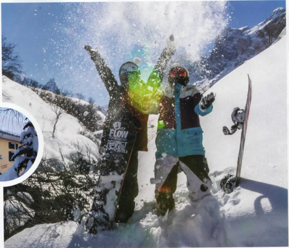
France is a fantastic destination for winter sports and Christmas markets