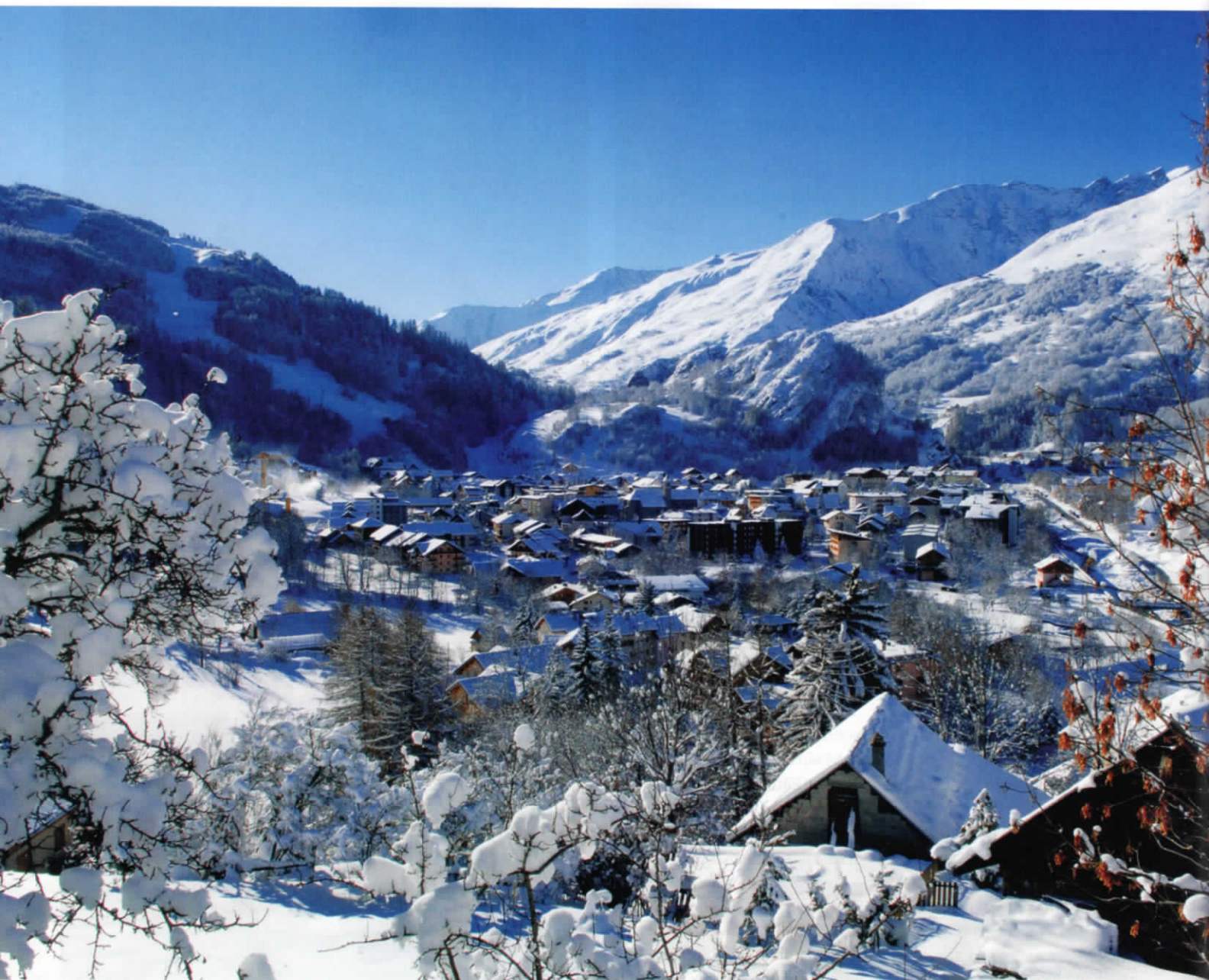
Come wintertime, resorts like Valloire Galibier become wonderlands of white snow and blue skies

white, and daring powder-hounds sniff out the toughest black runs and backcountry descents to test their mettle. Not sporty? There's also a vibrant après-ski scene, excellent shopping and a wealth of snug chalets to make that 'winter wonderland' dream a reality.